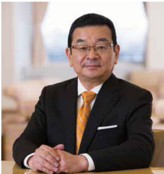
Takahiro Hachigo President, CEO and Representative Director